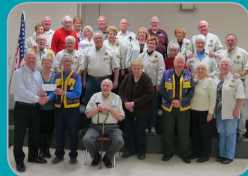
Crowe Valley Lions Club