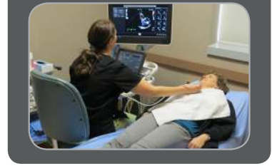
New echocardiography machine now in place at CMH

The Archie Meyers Society recognizes donors who have planned a future gift to the Campbellford Memorial Hospital. Leaving a bequest to CMH in your Will is an ideal way to continue making a difference to the health of our community for future generations. What greater gift could there be when your loved ones or friends need medical care. You can remember us in your Will with a bequest, make a gift of life insurance, donate a gift of stock or make another gift.