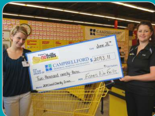
Fisher's No Frills 2014 Local Charity Drive