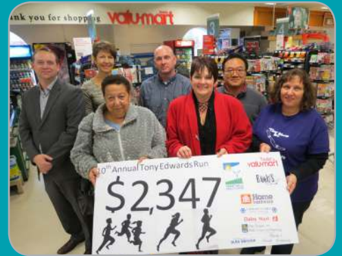
10th Annual Tony Edwards Run